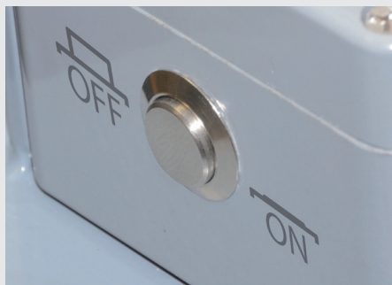
Digital Cable Counter with Bluetooth transmission