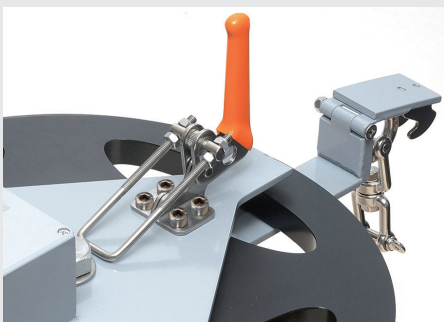
Toggle clamps latch